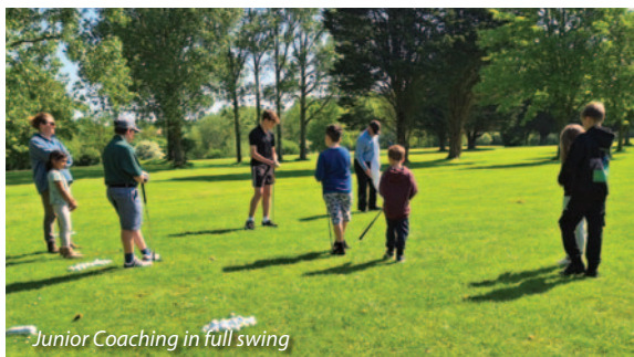
Junior Coaching in full swing