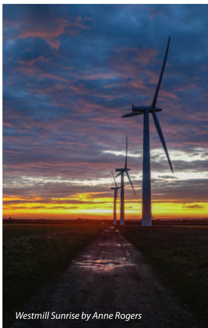
Westmill Sunrise by Anne Rogers

Members have been challenged with setting their cameras as if they were basic early film cameras and to