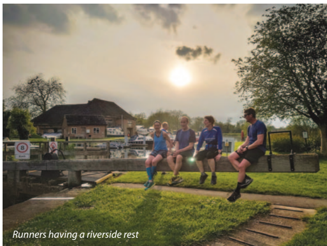
Runners having a riverside rest

Over the course of the summer our focus is now firmly back on training and enjoying the better weather. Throughout July and August the Highworth Running Club relocate its Wednesday evening club nights to varying locations nearby to enjoy trots along the Thames, runs along the Ridgeway, and wanders through woodland. Even better news is that the meeting places are often in public house car parks so rehydration afterwards is just as popular as the running; actually more turn up to rehydrate than turn up to run to be honest. Our abilities are quite eclectic so there's plenty of stopping and re-grouping to ensure no-one gets left behind. If