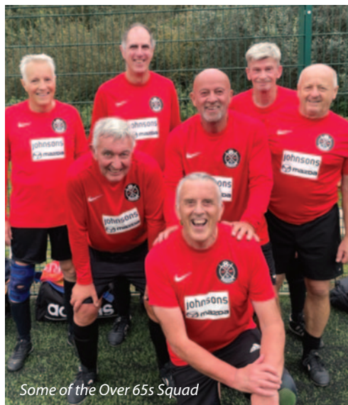
Some of the Over 65s Squad