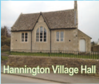
Hannington Village Hall

Available for Hire: for Parties and other events Pilates, Yoga and other classes currently available for further information contact: