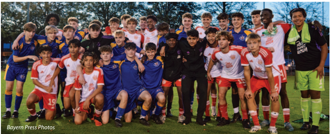
Bayern Press Photos