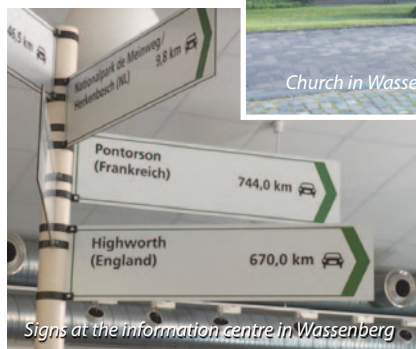
Signs at the information centre in Wassenberg

Apart from living in the Highworth area there is no particular requirement to participate and you certainly don't need to speak German – I don't. If you are interested and have questions please email or phone. And if you would like to come please let me know! New