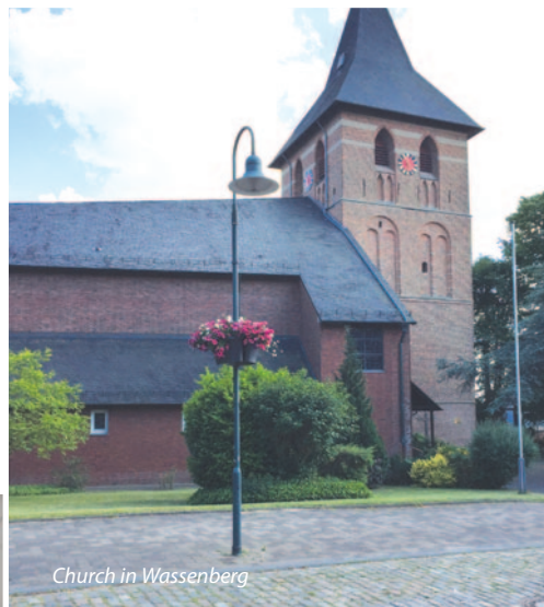
Church in Wassenberg

Wassenberg is a lovely place to visit and we are lucky to be twinned with such a beautiful town. We will likely take an outing during the weekend so you will see some of surrounding North Rhine Westphalia and probably Roermond, the nearest city, which is in the Netherlands.