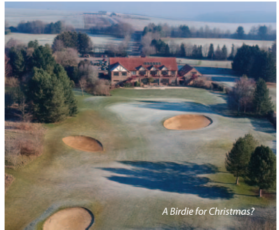
A Birdie for Christmas?