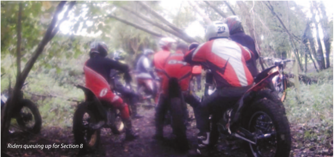
Riders queuing up for Section 8