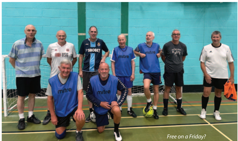
Free on a Friday?