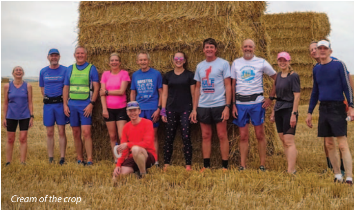
Cream of the crop