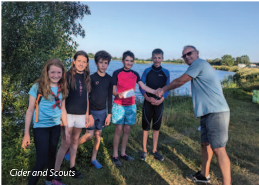
Cider and Scouts

In the autumn a small group of scouts, as part of their