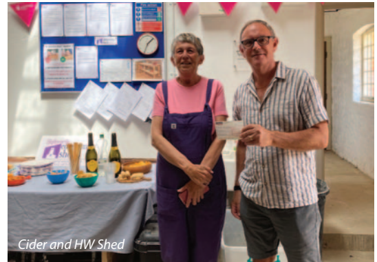
Cider and HW Shed