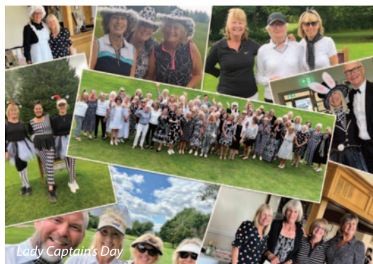
Lady Captain's Day