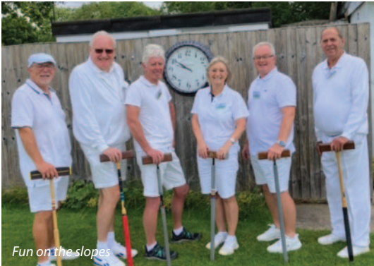
Fun on the slopes