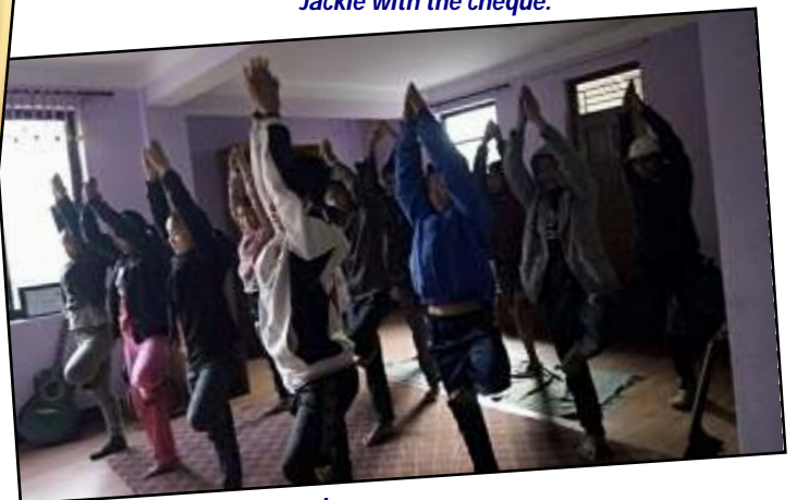
The children do yoga everyday.

to raise funds for 1 whole year of school fees so far $3,500 raised. Our children have a connection because they practice yoga every day and very much enjoyed the 'new-style' yoga class Roni gave them.