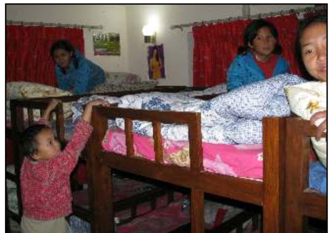
The lovely new wooden beds we had made with new mattress and blankets October 2009.

This is a major enterprise so we are making AN APPEAL . Would YOU (or a group of you together) like to SPONSOR A BED and ALL THE STUFF that goes with it - including A PAIR OF PYJAMAS at the bargain sum of £100 .