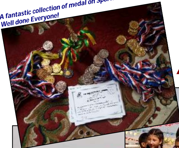
A fantastic collection of medal on Sports Day. Well done Everyone!