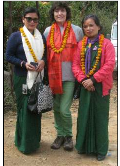
5 feet and 2 inches is quite tall in Nepal!

In Nepal where people are of short stature, especially village people, and where I am tall (5 feet 2 inches and a bit!) our children are growing noticeably taller and some are now standing 'eyeball-to-eyeball' with me and one or two even taller!