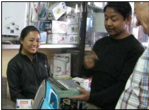
Years ago we taught the children to iron and now they are really good at it The irons get heavy usage and sometimes need replacing.