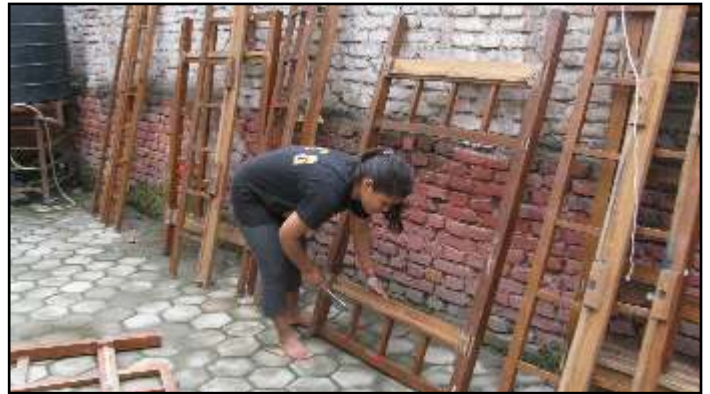
The beds are apart for our move to new house.. we go bed bug hunting April 2017.

So, we have decided to bite the bullet and have new beds made, and here is where the BIG comes in - not only that we will need to replace ALL THE BEDS but all the bedding as well - including mattress & cover/pillow & case/ blanket/ sheets - and then FUMIGATE THE HOUSE. The project will be on a military scale, needing precision timing. It will take place early in our next visit in Spring. Meantime we have to give the order for the beds as making 20 beds will take a little time. They will be simple in design and mostly not bunks.