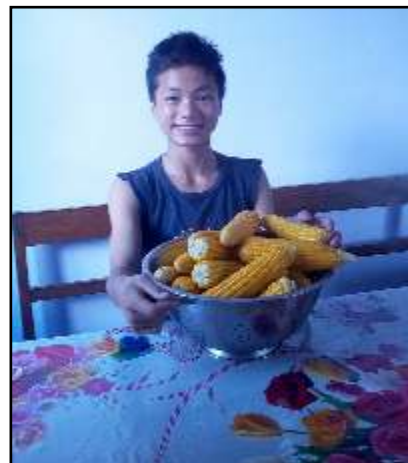
Smile and sweet corn