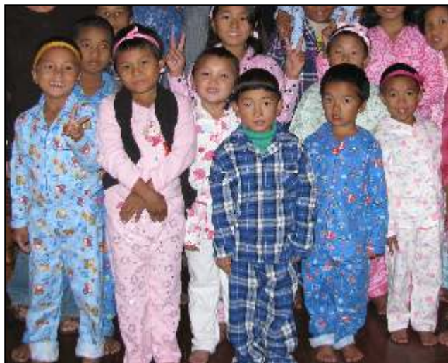
The children so loved their first-ever pyjamas, they did not want to take them off! 2010.

We thought it would be rather fun for you to 'Name that Bed' (short ones please) and have it and your name put on the end of the bed as a 'thank you'.